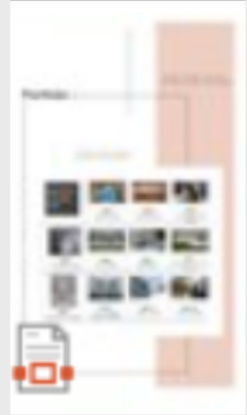
190303 protfolio (stream...) 7 分鐘前