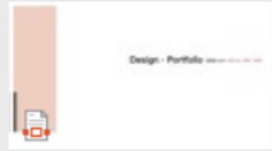
Design portfolio by MAO-TZU LO 昨天 下午 07:30