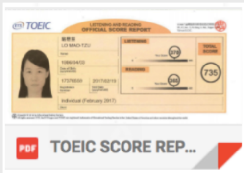
TOEIC SCORE REPORT(... 昨天 下午 07:30