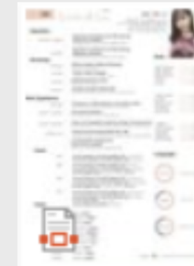
Elisava cv (Mao-Tzu,Lo)... 昨天 下午 07:29