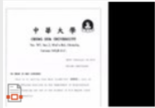
Certificate of Enrollment... 昨天 下午 07:27